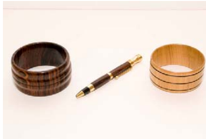
Bangles and Pen by Graham