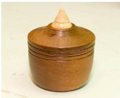
Box by Cecil